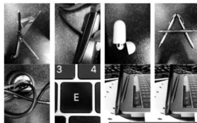
KYLA BELL R10H