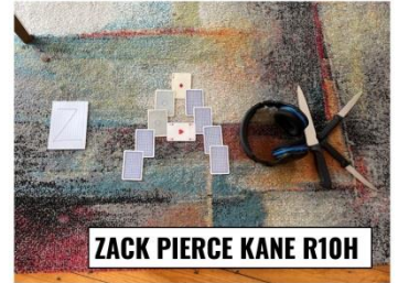
ZACK PIERCE KANE R10H