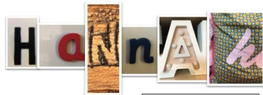
HANNAH BOLE R10M