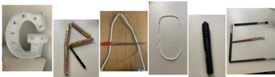
GRACIE KIDD-BEGGS R10M