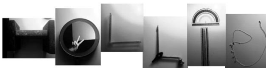
HOLLIE HARLEN R10M