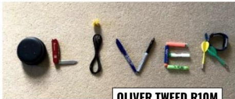
OLIVER TWEED R10M