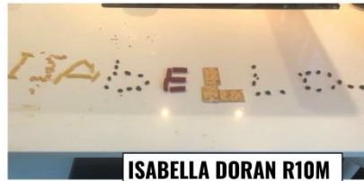
ISABELLA DORAN R10M